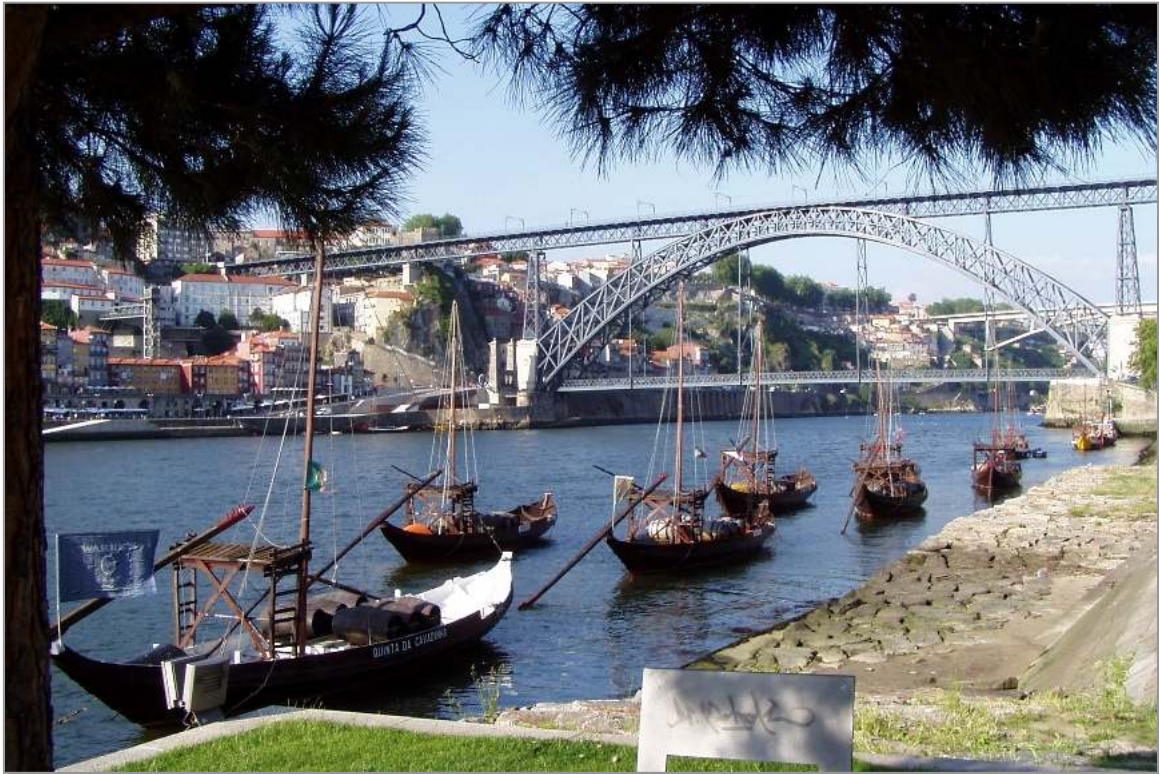
Dom Luis Bridge - Porto