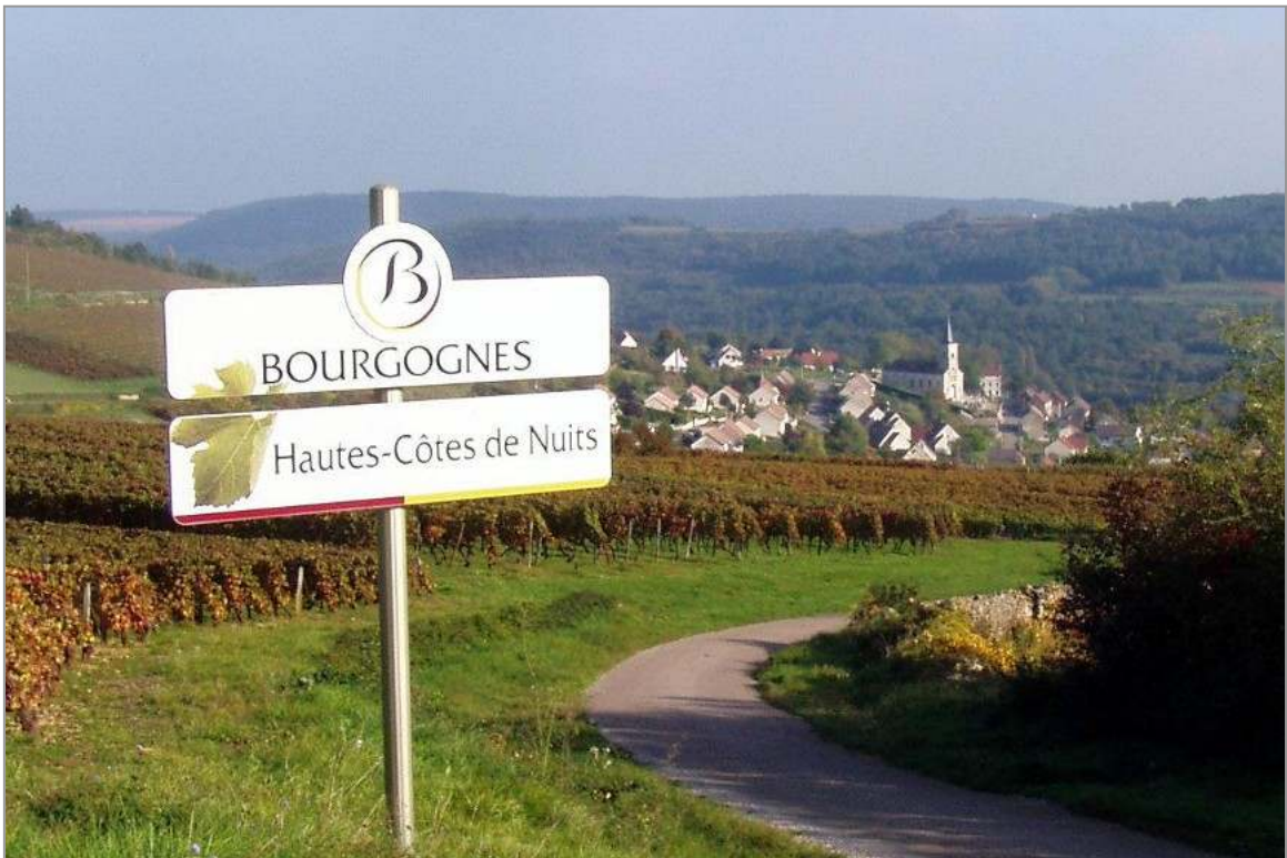
Cotes de Nuits - Burgundy