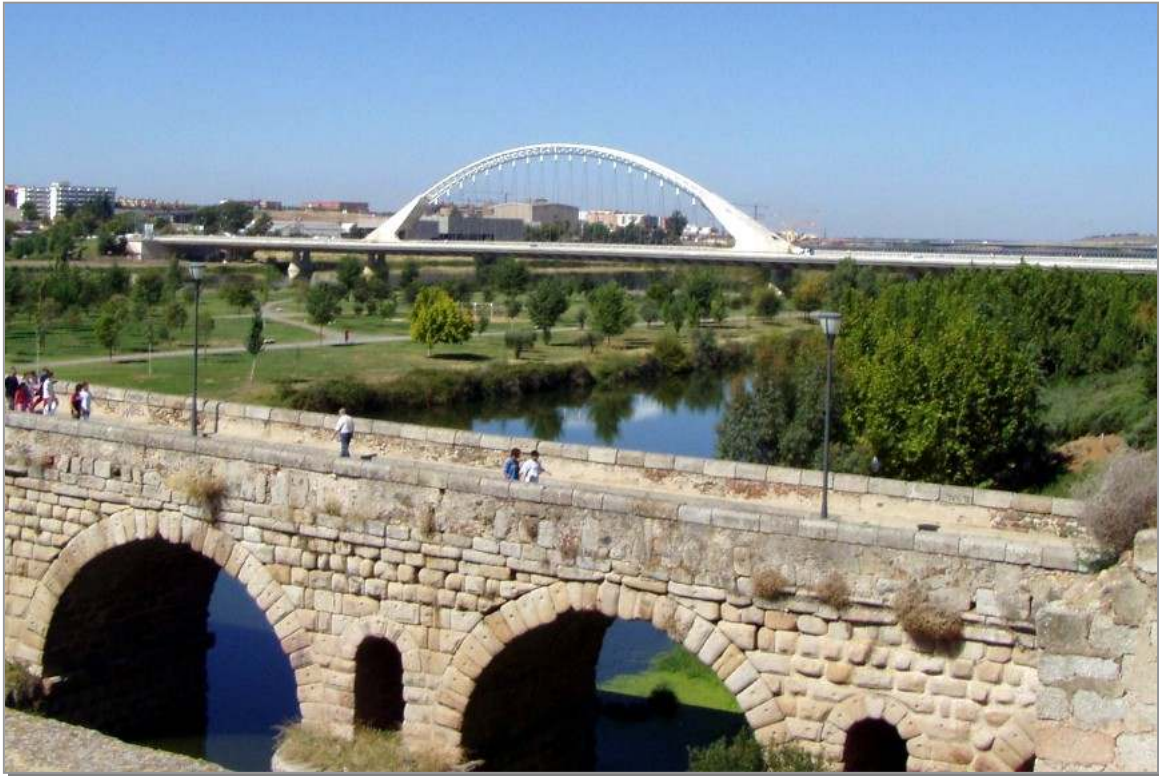
Ancient bridge by the Romans/Modern bridge by Santiago Calatrava - Merida