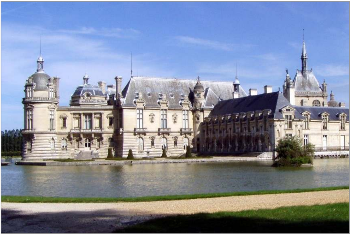
Chateau de Chantilly